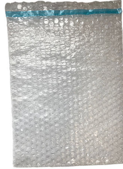
Bubble Wrap Envelope