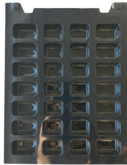
Clear plastic tray