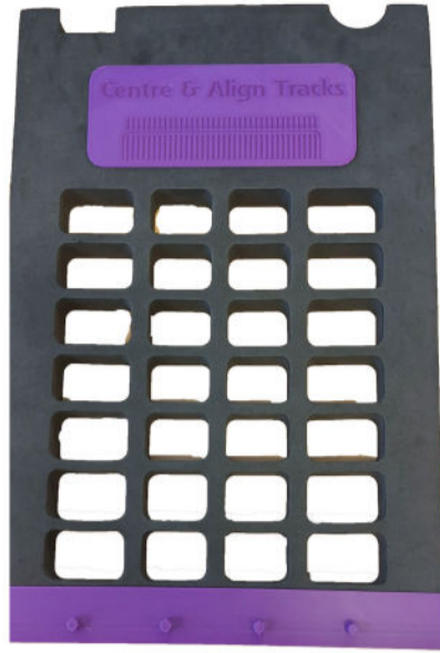
Black foam platen with seal alignment tool and track corrector.

BEFORE YOU START, YOU WILL NEED THESE 5 COMPONENTS